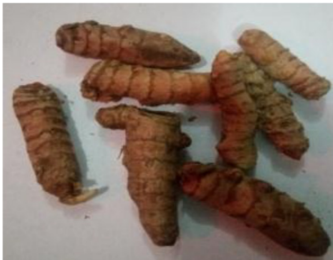
Figure 1: Curcuma longa (Turmeric).