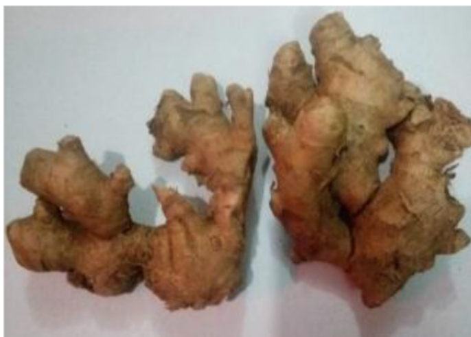
Figure 2: Zingiber officinale (Ginger).

The tendency of oxygen molecules to create free radicals is the crucial problem associated with the metabolic process, such as oxidation. 14 Oxidation, which is the biological process for energy production by the body, 15 increased exposure to environmental toxicants and dietary xenobiotics 16 are the complex biochemical reactions that result in the generation of Reactive Oxygen Species (ROS) and Reactive Nitrogen Species (RNS). These free radical by-products lead to oxidative stress by attacking vital organs; causing the cells to malfunction 15 and ultimately result in the development abnormal physiological conditions including mutagenesis, cellular ageing, coronary heart disease, diabetes. 17 Antioxidants are known to act protectively through one-electron reactions with free radicals, 16,18 thereby reducing the oxidative damage caused in the body, inhibiting the peroxidation of lipids and by retarding the progress of many diseases. 19 This highlights the need for a balance between free radical and antioxidant concentrations for proper physiological functions. 18